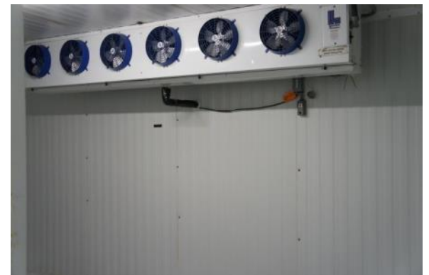
Freezer (-10°F) 9' x 17'-6"