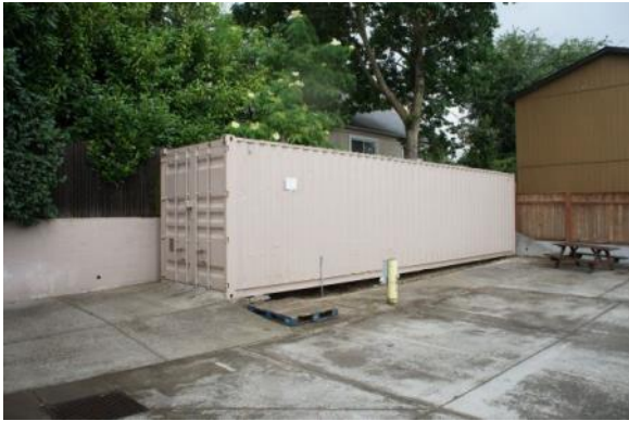
40' Container-Auxiliary storage (Inc.)