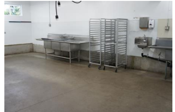
Sinks-North Production area