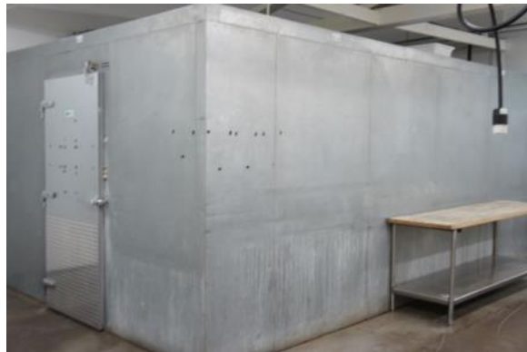
Walk-in (12' x 20')