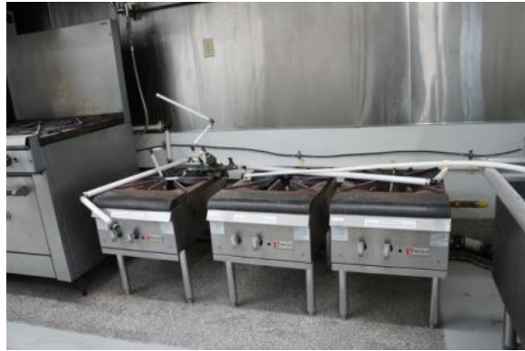
3 ea. High Heat Burners