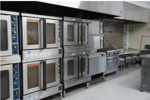
3 Dual Convection Ovens, Dual Steamer